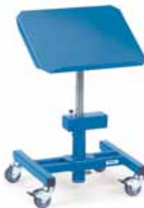
3290 | 3291