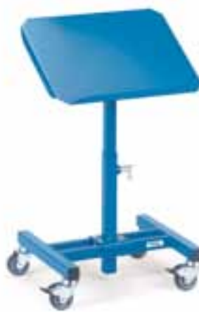
3280 | 3282