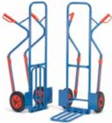
K 1330 | K 1330 L