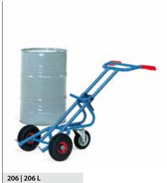
206 | 206 L