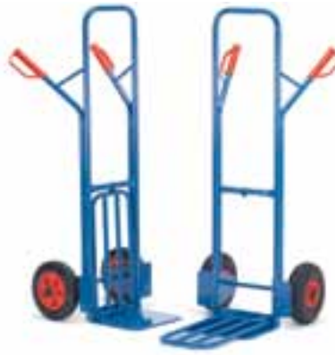
K 1326 | K 1326 L