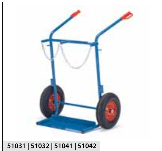
51031 | 51032 | 51041 | 51042