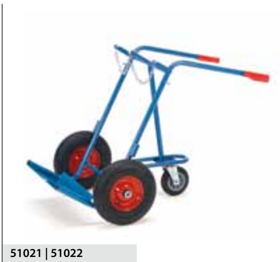
51021 | 51022

For 2 bottles, each 40-50 litres contents, Ø 204-229 mm. Receptacle for welding wire.