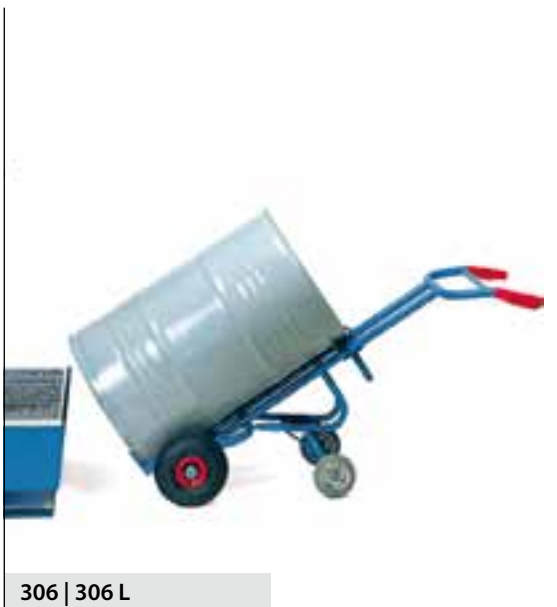
306 | 306 L