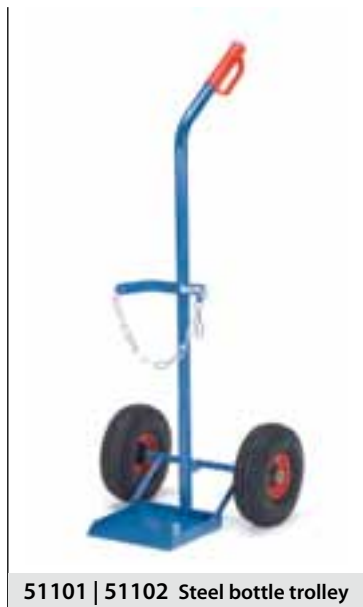
51101 | 51102 Steel bottle trolley

as 51160, but additionally with a clamp for winding up hose and a holder for shrink wrapping pistols.