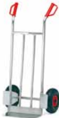
A 1115 L