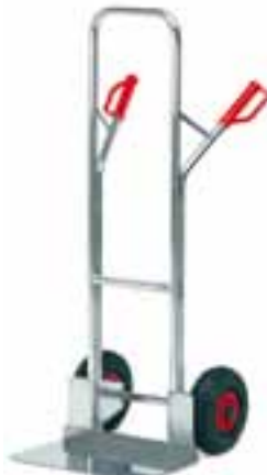
A 1326 L