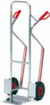
A 1330 L