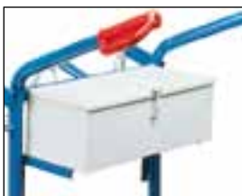
Tool box 51060

as 51011/51012, but for 2 propane gas bottles each 33 kg contents, Ø 318 mm.