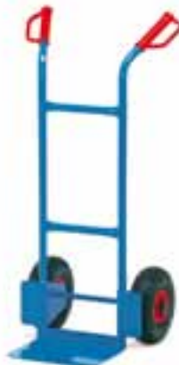
B 1125 L