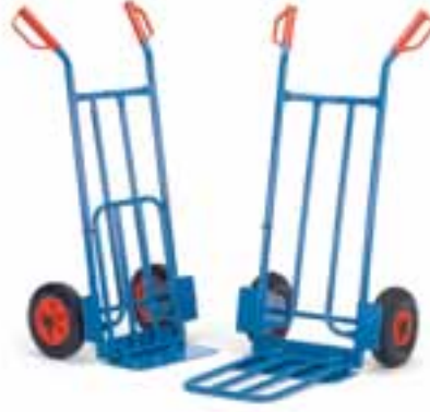
K 1116 | K 1116 L