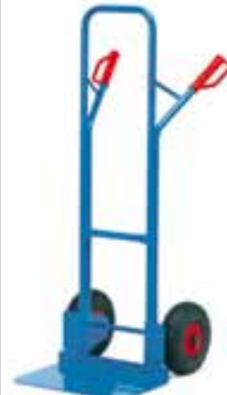
B 1326 L