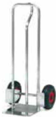
A 1110 L