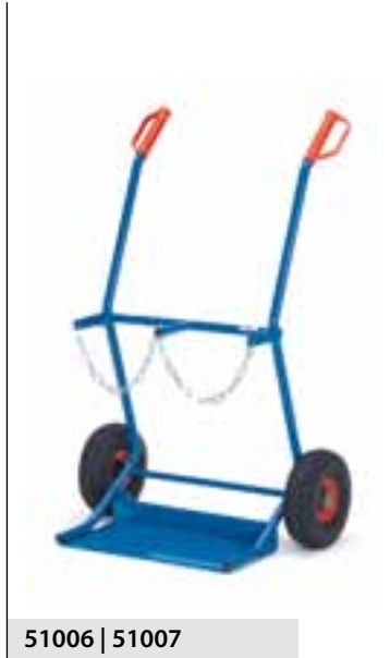
51006 | 51007