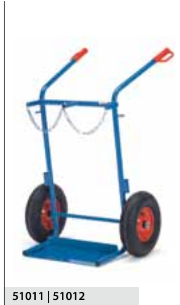
51011 | 51012