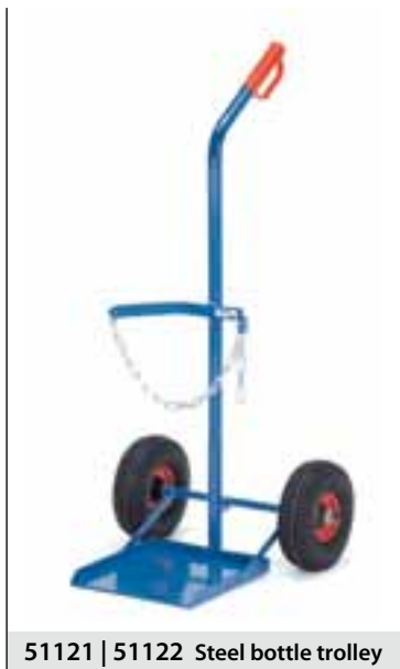
51121 | 51122 Steel bottle trolley