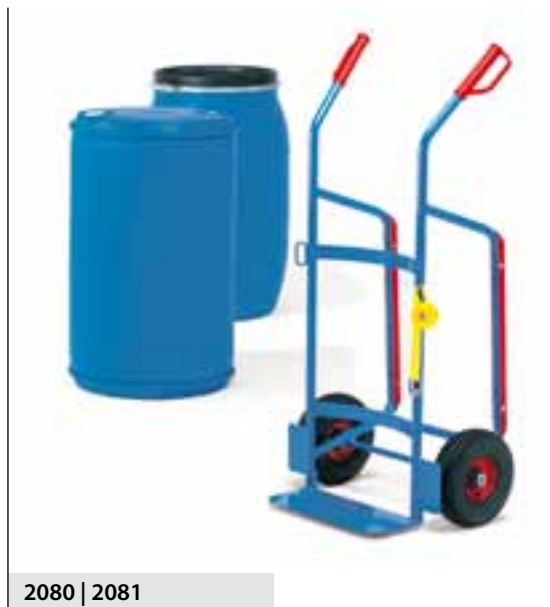
2080 | 2081