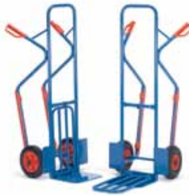
K 1331 | K 1331 L