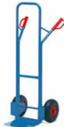
B 1325 L