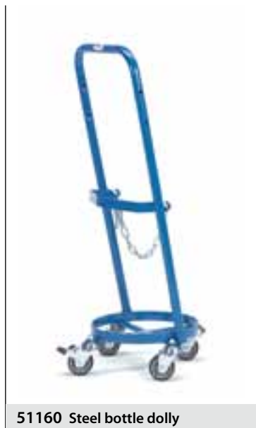
51160 Steel bottle dolly