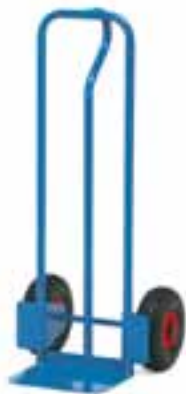
B 1110 L