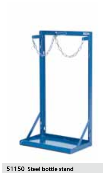
51150 Steel bottle stand