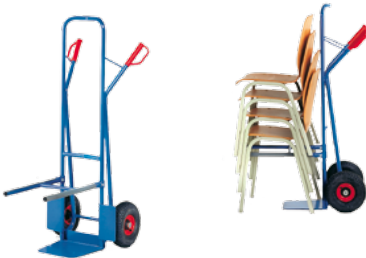
S 101 | S 101 L

Especially robust and easy to use. Top quality materials and first class workmanship guarantee the best possible handling and durability. Tyres with steelsheet rims.