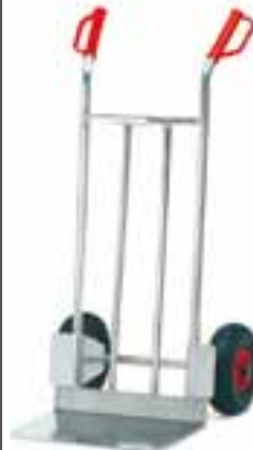
A 1116 L