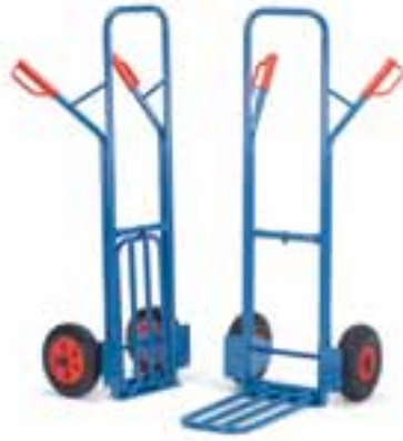
K 1325 | K 1325 L