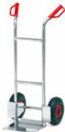
A 1125 L