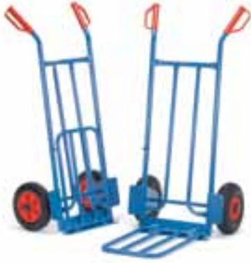
K 1115 | K 1115 L