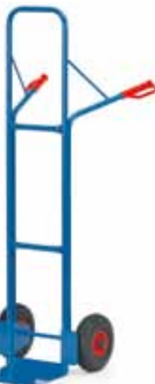
B 1327 L