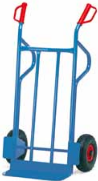
B 1215 L