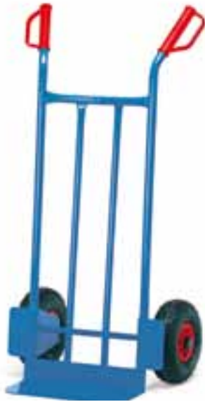
B 1115 L