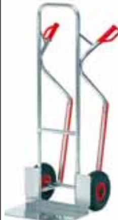
A 1331 L