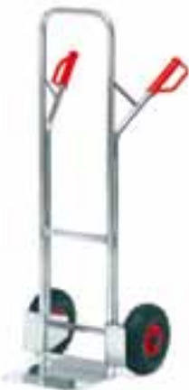
A 1325 L