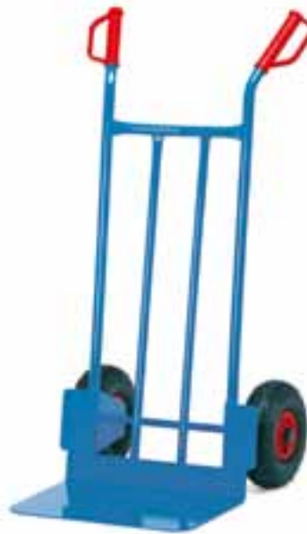
B 1116 L