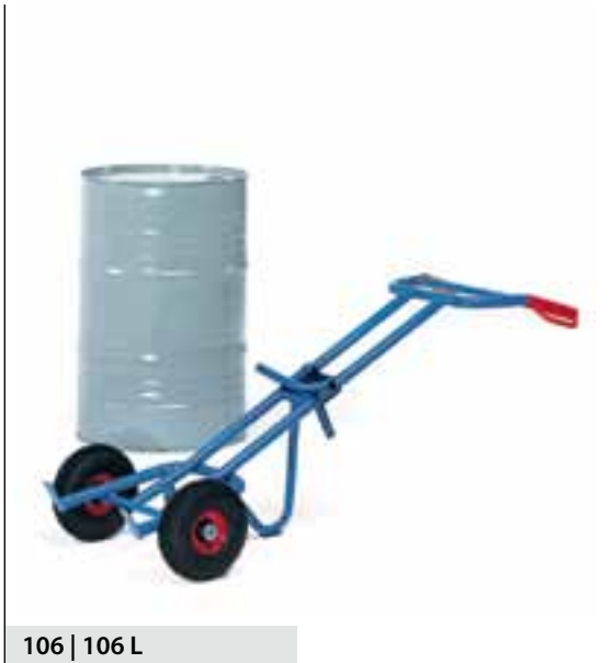
106 | 106 L