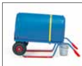
Trolley with drum in filling position