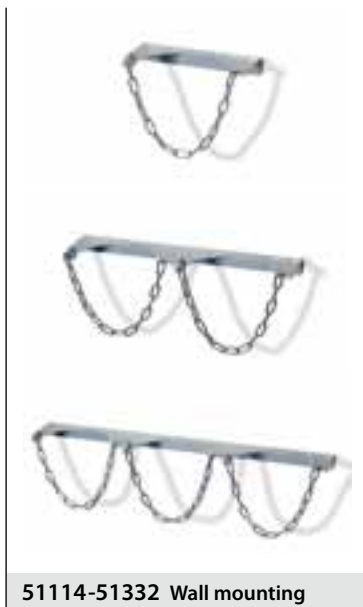
51114-51332 Wall mounting