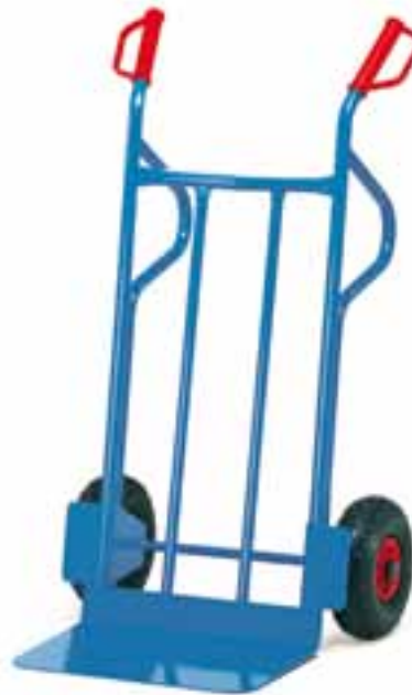
B 1216 L