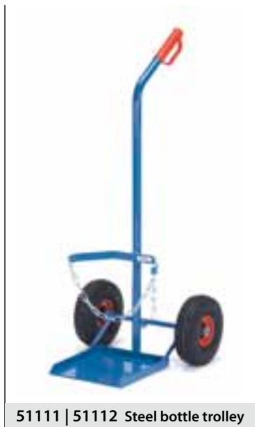
51111 | 51112 Steel bottle trolley