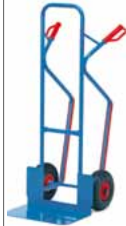
B 1331 L