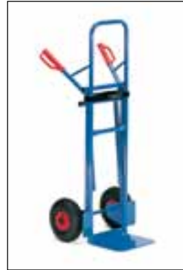
Carrying arms put in resting position.