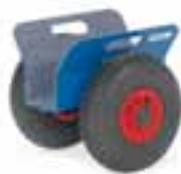
4157 | 4158