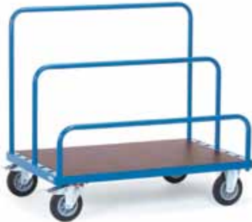
4463 | 4463-1 | 4465 | 4465-1 Trolleys for sheet material