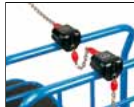
Deposit locks made of high-quality plastic, to be operated easily and safely. Suitable for 1 Euro coins.