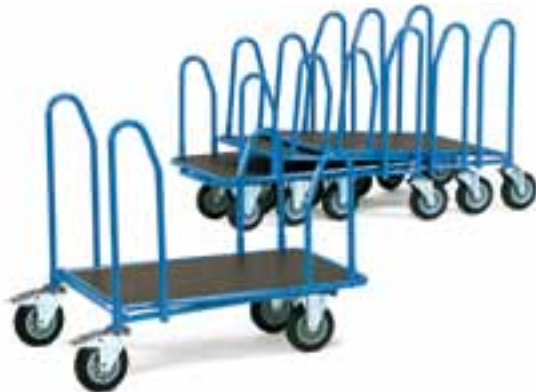
2980 | 2981 | 2982