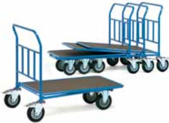
2960 | 2961 | 2962