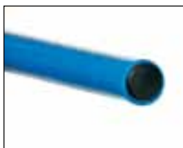
Trolley with carrier spars with PVC hose