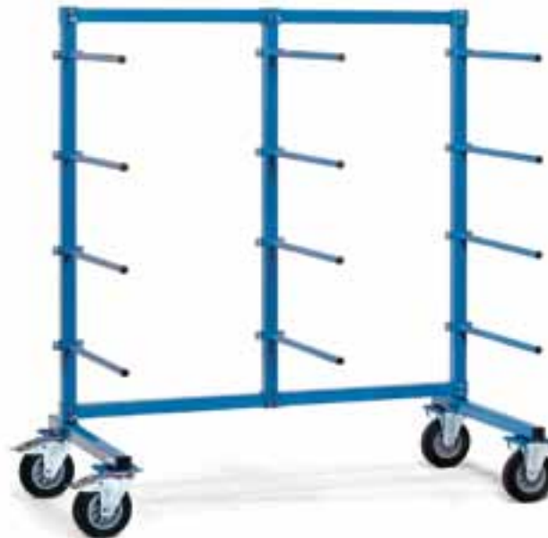
4614 | 4615 | 4616