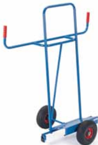
1075 | 1076