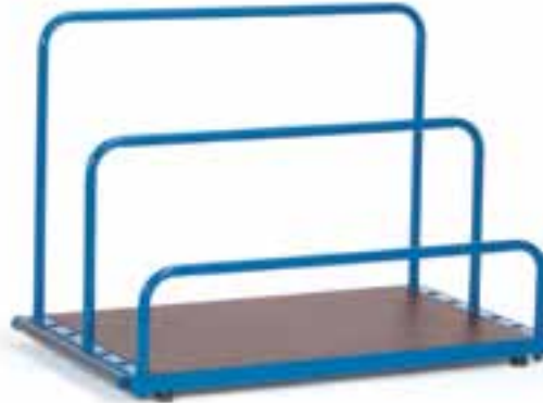
4363 | 4365 Stands for sheet material