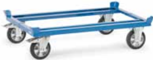
22809 | 22810 | 22811 | 22812