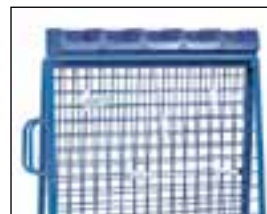
Deposit with open storage box