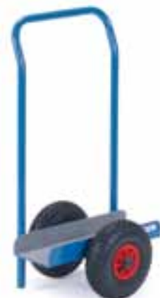
4175 | 4176