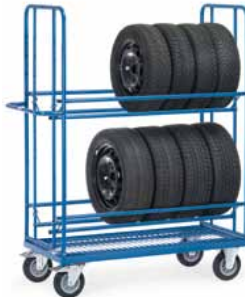
4595 | 4596 Tyre trolleys