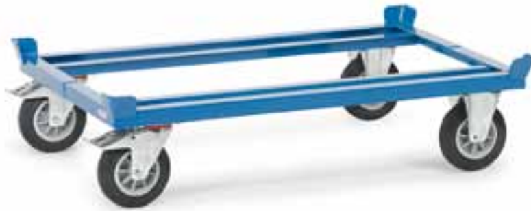
22799 | 22800 | 22801 | 22802

Pallet dollies for pallets and boxes. Sturdy sectional steel construction with 4 catch corners for stacking, powder coated.