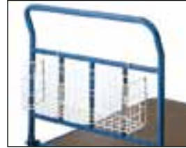
Wire basket for small items 600 x 140 x 200 mm