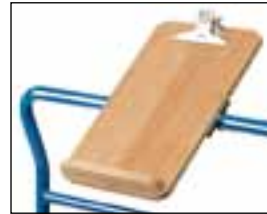
Clip board see also page 92