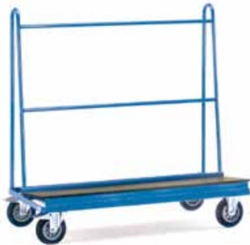
4445 Trolley for sheet material