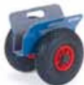
4155 | 4156

Secure clamping by the weight of the load on the clamping construction. Maximal clamping width: 0-60 mm.