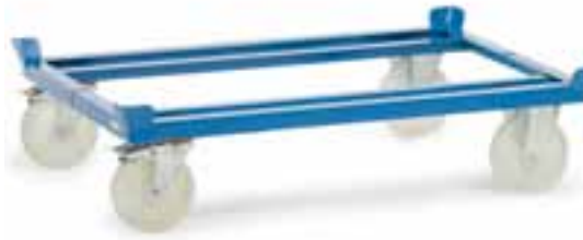
22879 | 22880 | 22881 | 22882