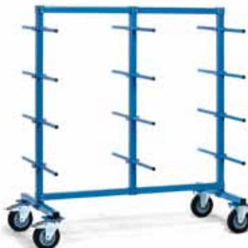
Modules for trolleys with carrier spars