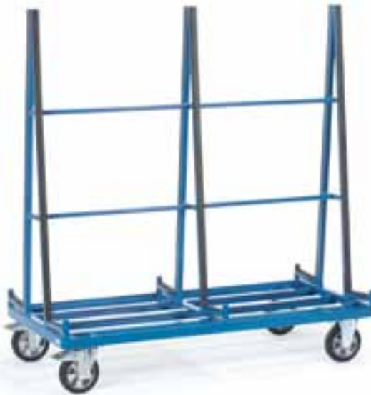
4474 | 4475 | 4476