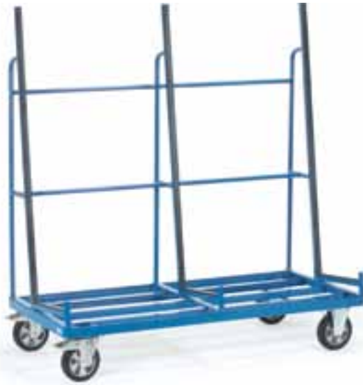
4454 | 4455 | 4456

Support width 2 x 230 mm, support height 1450 mm, Total height 1810 mm.