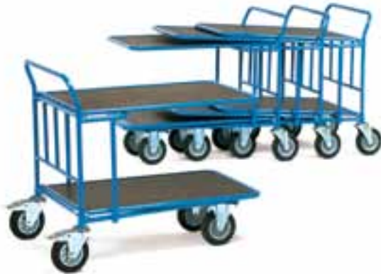
2970 | 2971 | 2972