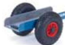
4165 | 4166