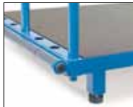
Accessories for sheet material stands:

Pallet feet for 100 mm fork-lift access.