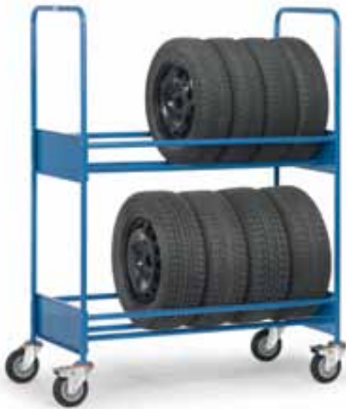
4585 | 4586 Tyre trolleys

Tubular steel and steel section construction, powder coated. Shelves with welded wire lattice 140 x 40 mm. Carriers variably insertable within a distance of 120 mm. Due to the joint-like attachment, the carriers adapt automatically to the tyre size. 2 castors and 2 fixed wheels, solid rubber tyres, hubs with roller bearings. Castors with wheel locks.