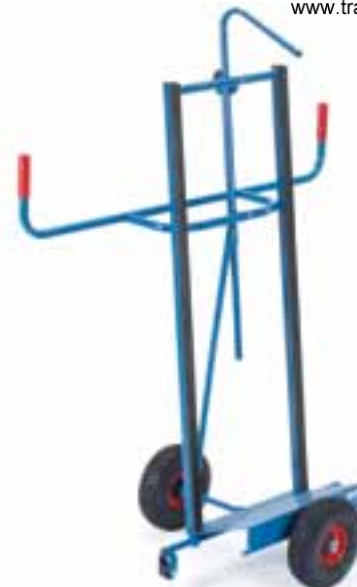
2075 | 2076