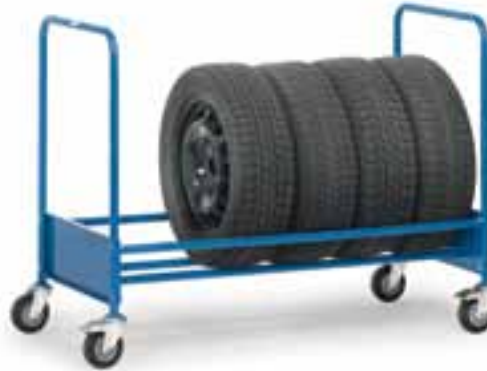
4575 Tyre trolleys