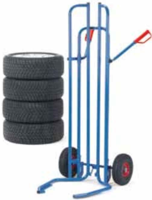
2032 | 2033 Tyre trucks