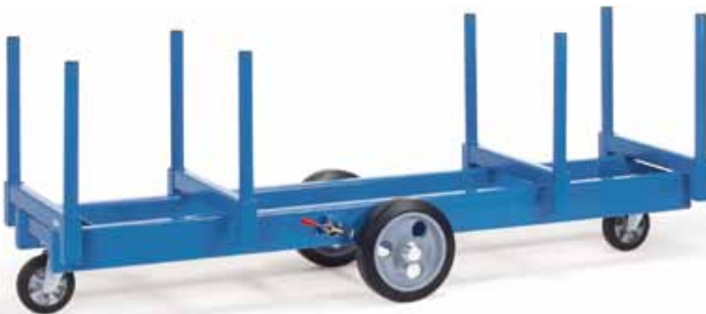
2113 | 2123