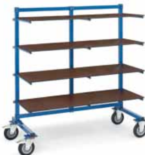
Shelves for trolleys with carrier spars