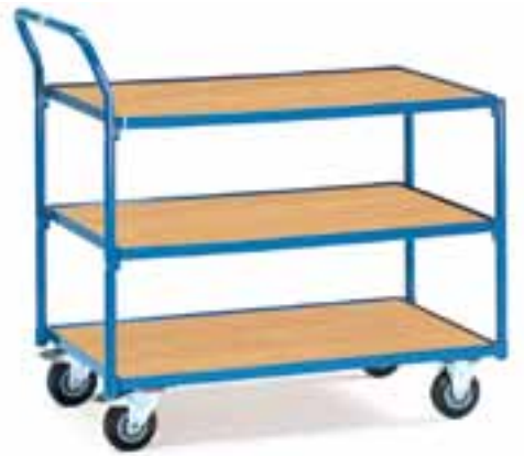
2750 | 2752