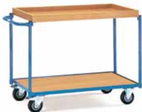
3940 | 3942