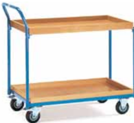
3760 | 3762