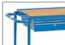
2922 as 2622, but with horizontal push bar.