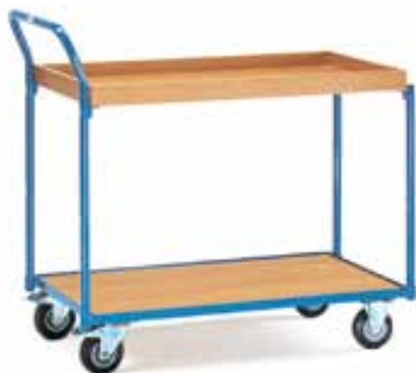
3740 | 3742