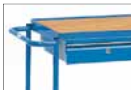
3922 as 3622, but with horizontal push bar.