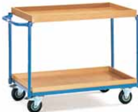
3960 | 3962