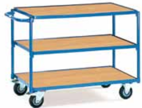
2950 | 2952