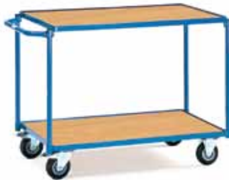
2940 | 2942