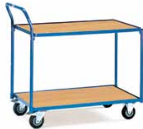
2740 | 2742